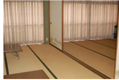
Figure 1. Image of ACCOMMODATION D