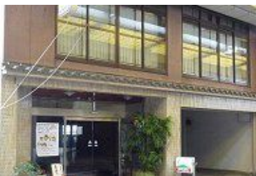
Figure 1. Image of ACCOMMODATION C